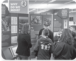
Pictured above: MMS students learned about human migration at the Smithsonian Exhibit.

MMS 6 th graders studied the concept “moving” during their Ancient Civilization unit. In April, the students had the opportunity to travel to Two Rivers, WI to see the exhibition World on the Move: 250,000 Years of Human Migration , developed by the American Anthropological Association along with the Smithsonian’s Center for Folklife and Cultural Heritage. The exhibit featured the ancient civilizations that the students studied in class, and explained the reasons why people move and how societies relocate due to various circumstances.