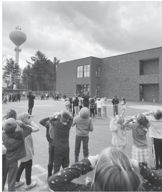
Pictured right: Elementary students use solar eclipse glasses to watch as the moon passes between the earth and the sun.

Students had the opportunity to view the solar eclipse on April 8th, thanks to the Mosinee PTO's generous mini grant that was used to purchase special glasses for K-5 students. The cheers of excitement said it all as the clouds parted ways allowing the kids to see this unique celestial event!